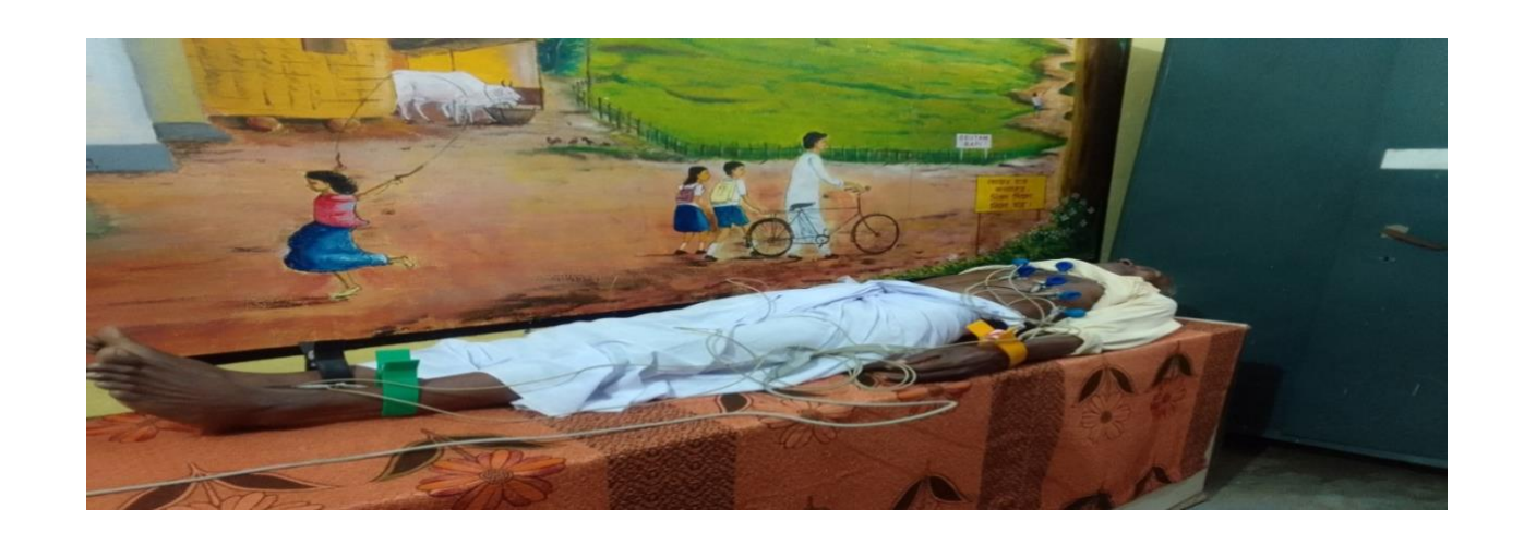
Findings of the Health Checkup