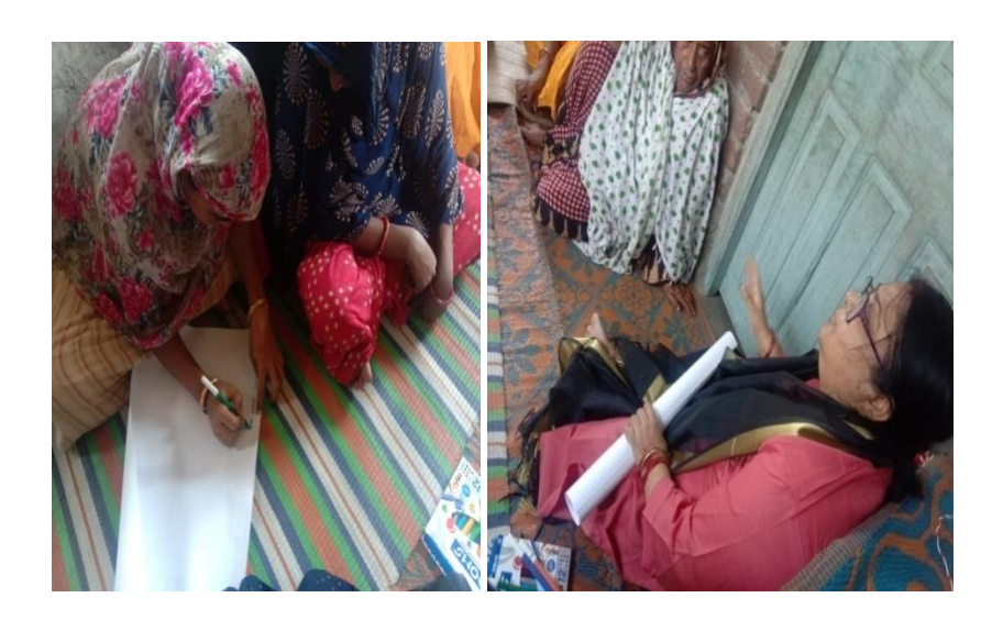
PRA with the women of Murshidabad

Before the FGD, Participatory Rural Appraisal was conducted to get more knowledge about the health culture of the Rural Women of Murshidabad and Nadia from their own perspectives. PRA Tools were developed to get desired information from the community members who were not literate and were unable to express themselves in a meaningful way.